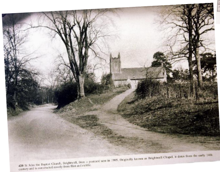
429 St John the Baptist Church, Brightwell, from a postcard sent in 1905. Originally known as Brightwell Chapel, it dates from the early 14th century and is constructed mostly from flint and rubble.