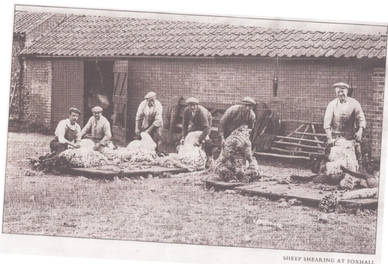
SHEEP SHEARING AT FOXHALL